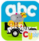
Cyw a'r Wyddor